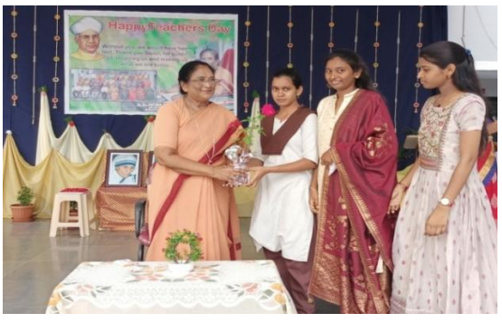
Students honouring Principal