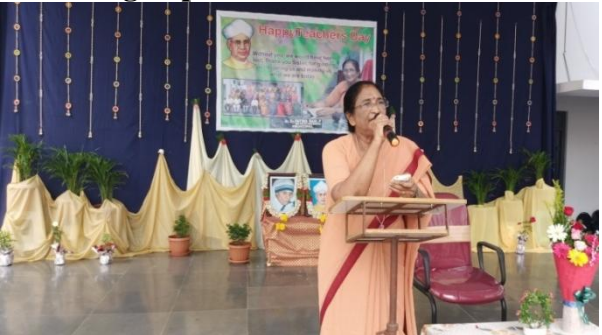
Principal addressing Staff & Students