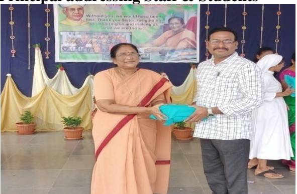
Principal felicitating the StaffStudents cultural activity on Teachers day