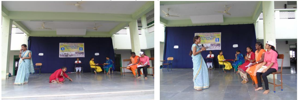
Skit play by the students regarding importance of white cane day