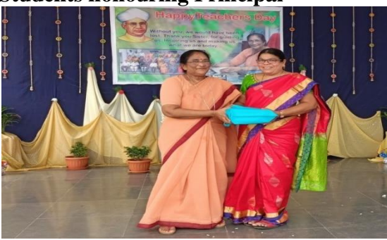
Principal felicitating the Staff